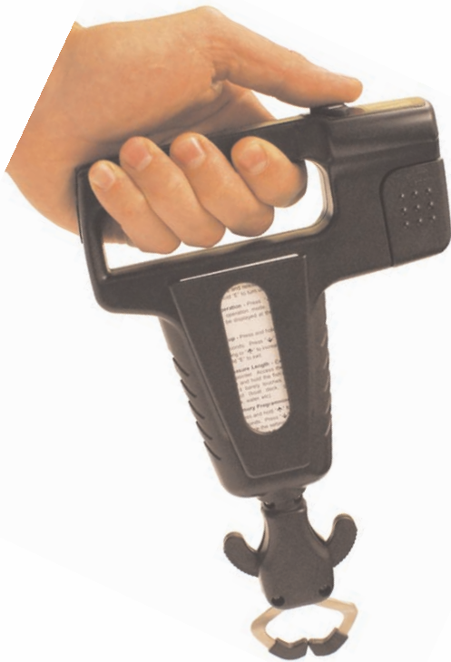
Onboard Memory System Records User Settings